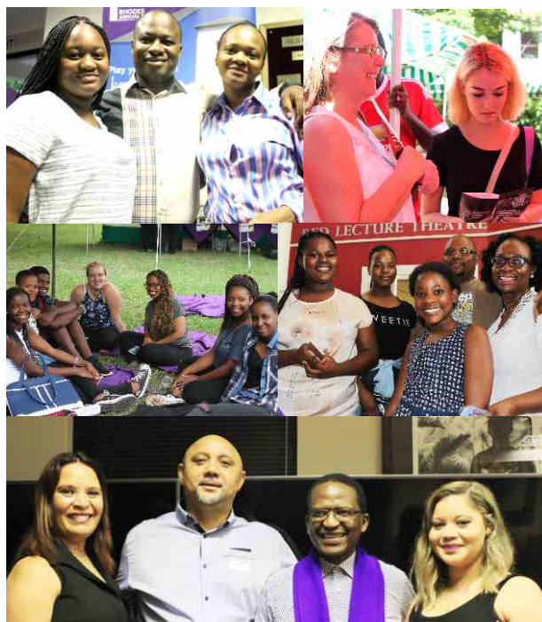
New and returning students with their families