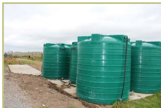
Water security measures taken to buffer the research against the unreliable water supply