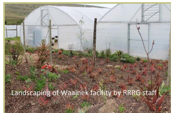
Landscaping of Waainek facility by RRRG staff