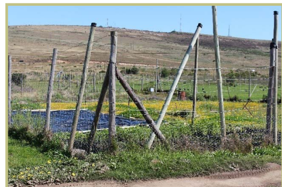
Before and after photos of the area where tunnel no 2 now stands