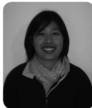
Grace Sing Gen Carpe Diem - Seize the day