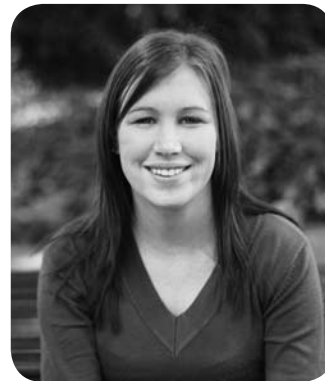
Kate Selwood "Let us step into the night and pursue that flighty temptress, adventure" Albus Dumbledore