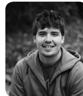
Chris Tucker The more things change, the more they stay the same