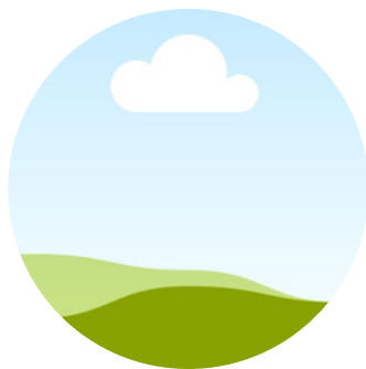
Vacant Snr Manager: Academic Support Services