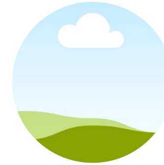
Vacant Principal Librarian: Metadata & Quality Assurance