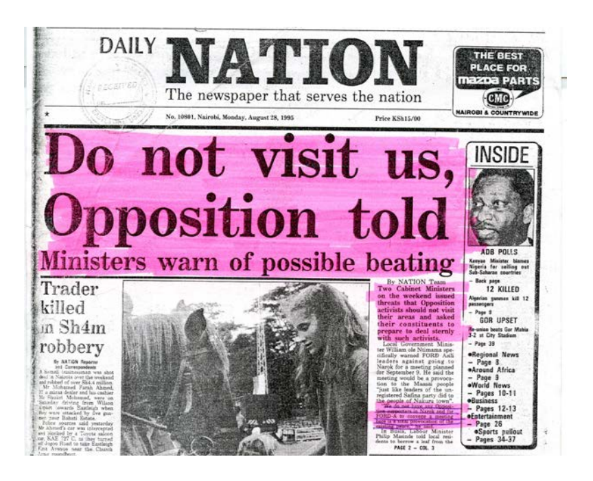
Figure 1: Courtesy of the Daily Nation

youth wingers, the provincial administration, the police or all of them in combination. To a great extent, the inability of the various Kenyan parties to establish a national presence had to do with the "zoning" activities of the government. Quite often party leaders and officials ventured into "KANU Zones" at great peril and amidst threats from senior government officials. One news headline of the Daily Nation read, "Do not visit us, opposition told".