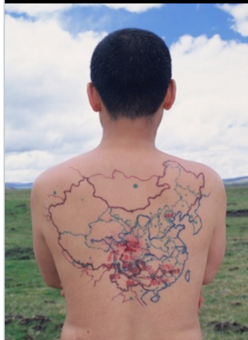
Top: Wu Junyong, Flower of Chaos , 2009 Animation video