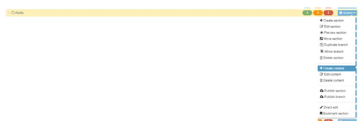
Figure 1: Adding content to the Aside section