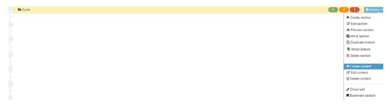
Figure 1: Adding content to a section