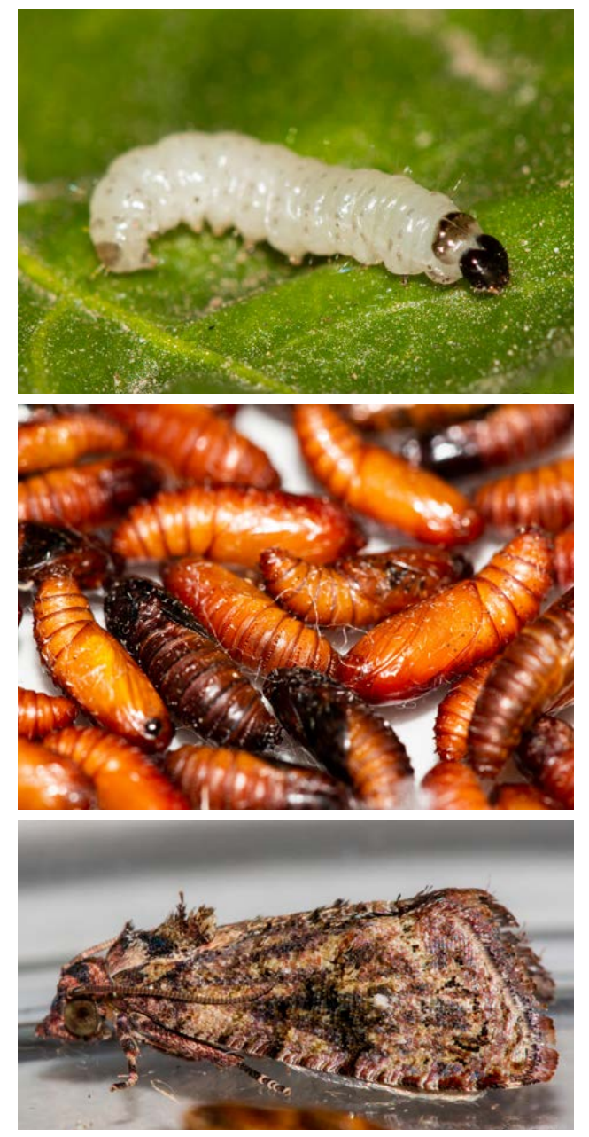
False codling moth larvae (top), pupae (middle) and adult moth (below).

The sterile insect technique (SIT) for false codling moth (FCM) has been commercially implemented in citrus in South Africa since 2007, with generally good success. However, a few possible problems have been identified and there is a continual pursuit to improve the quality and performance of the sterile moths. Thus, this study focused on various aspects: first, the lack of activity of sterile moths compared to wild moths at cooler temperatures.