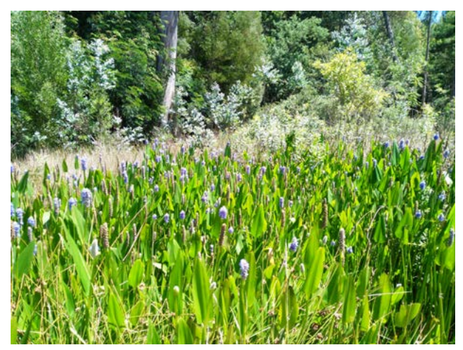
A pickerelweed infestation in Hogsback.

These studies will aid the development of a biological control programme. Surveying and identifying potential biological control agents should be based on the agent's ability to decrease asexual spread (e.g. by damaging the plant's rhizomes) to ensure the greatest impact and control of pickerelweed invasion.