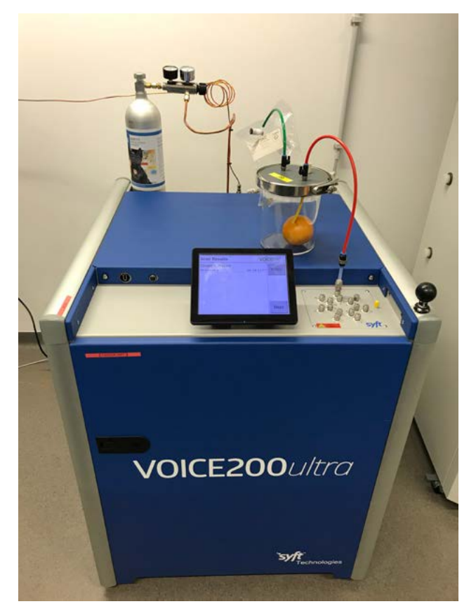
Gas chromatography-mass spectrometry (GCMS) analysis of citrus fruit volatiles.

ten days after infestation. Twenty percent of the control fruit were incorrectly classed as infested. A Selected Ion Flow Tube Mass Spectrometry (Sift-MS) unit at the University of Leuven in Belgium could differentiate between healthy fruit and fruit injured 24 hours earlier after a few seconds of real-time volatile detection and analysis.