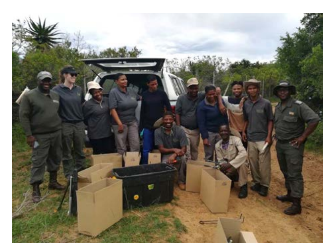
CBC members and staff rangers after the release of 640 Hypogeococcus festerianus galls on the Queen of the Night Cactaceae in Thomas Baines Nature Reserve in April 2019.

The data from long-term monitoring are supported by data from surveys of the perceptions of land-users who are using biological control agents from the CBC massrearing facility. Over 70% of the land-users reported that the agents had reduced cactus infestations, and over 90% said that they would recommend the use of cactus biological control agents to other land-users. This is particularly impressive, given that biological control is a long-term solution and many land-users have not had the agent on their land for long enough for the full impact of the agent to be realised.