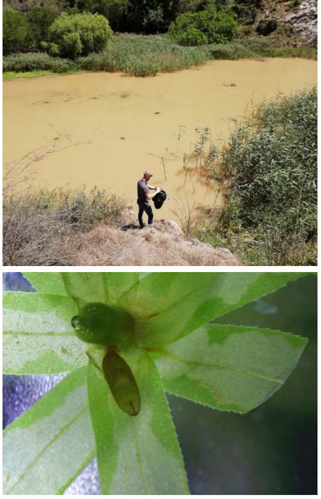
Matthew Paper releasing immatures of the Egeria leaf-mining fly into the Groot River, in the Baviaanskloof Nature Reserve. (top)

Recent results show that these may be new parasitoid species not yet described in South Africa. At this stage, it is unclear what impact the parasitoid will have on populations of the fly in the field, but this is being monitored.