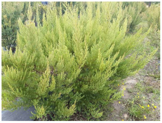
Traditionally wild harvested, Honeybush tea is now grown commercially.

of damage with which it is associated in cultivated honeybush fields. This will involve extensive sampling of cultivated honeybush fields, natural honeybush stands and surrounding refugia, especially where Keurboom trees are present. Complementing this research, several soil samples have been collected from the previously surveyed farms and used to isolate entomopathogenic fungi. These fungi may offer a potential natural management tool for this pest species, and other pest species associated with honeybush. Attempts to rear this insect using artificial diet will be investigated.