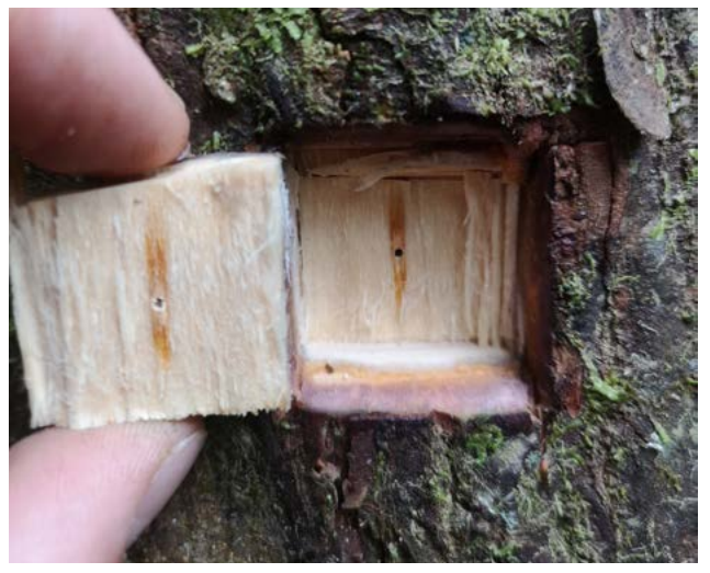
The entry hole from the polyphagous shot hole borer beetle on an Oteniqua yellowwood in the Western Cape.