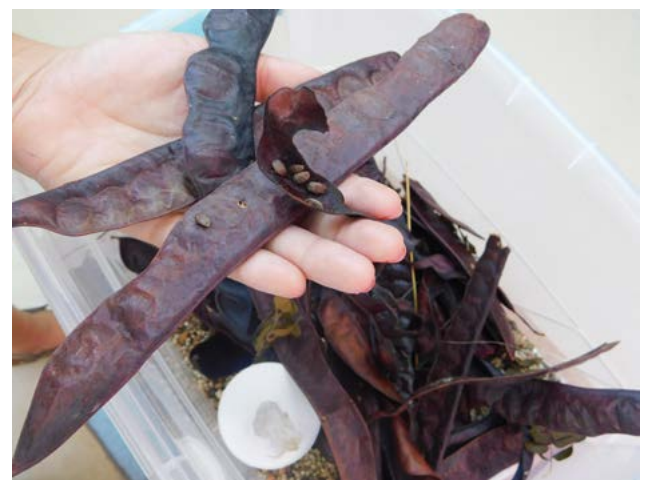
The seed weevil, Amblycerus robiniae, cultured on Honey locust pods in the CBC quarantine.

International collaboration has been developed between the CBC and the Chinese Academy of Sciences; the Sustainable Management of Agricultural Ecosystems Laboratory (UTAGRI-ECO) in Rome Italy; the Department of Entomology, Virginia Tech Blacksburg, and the Centre of the Region Haná for Biotechnological and Agricultural Research, Crop Research Institute, Czech Republic.