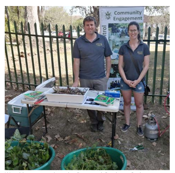
Weed buster week in the Botanical Gardens, Grahamstown.

Weed Buster Week is an initiative that was started by the Department of Environment, Forestry and Fisheries (DEFF) to create awareness around weeds. For Weed Buster Week this year, CBC had an invasive awareness event in our local botanical gardens in collaboration with the Makhanda/Grahamstown Park Run. The attendance was great and the community members enjoyed removing weeds and hearing about biological control from our staff and students. We look forward to making this an annual event.