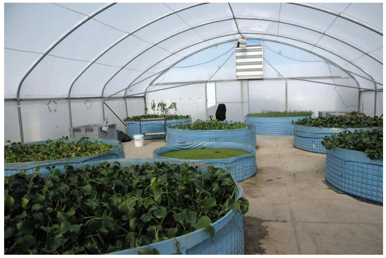
One of the tunnels at the Waainek mass-rearing facility with pools of water hyacinth.

In 2019, the Waainek mass-rearing facility made a total of 55 releases of various biological control agents at sites around South Africa. More than 440 000 insects or immature larvae were released in seven provinces –