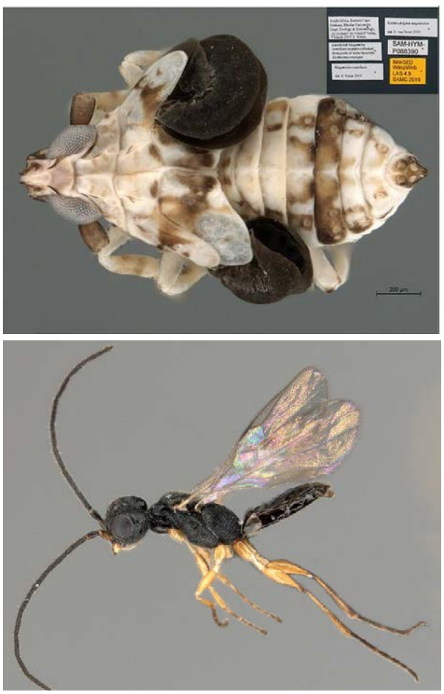
Megamelus scutellaris nymph parasitised by two Echthrodelphax migratorius larvae (top) and a male parisitoid wasp Echthrodelphax migratorius (bottom).

Dr Candice Owen has been delving deeper into the thermal physiology of the widely-established water hyacinth biocontrol agent, the weevil, Neochetina eichhorniae . Assessment of insect thermal physiology is a tool that has recently been gaining popularity in weed biological control, but the classical methods used look