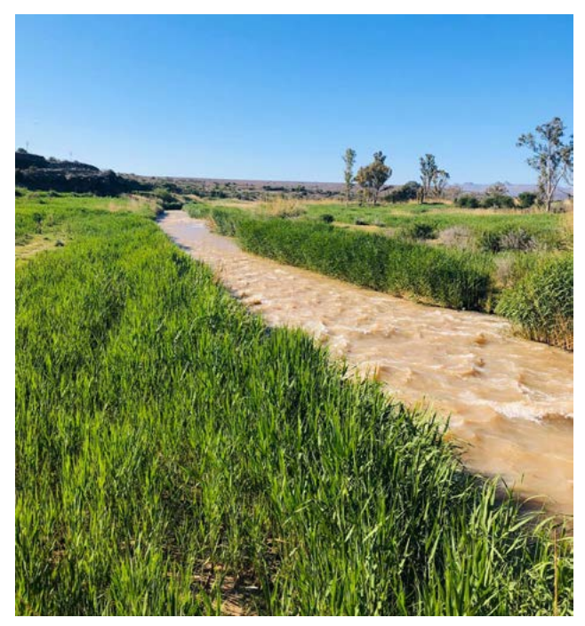
Arundo donax invasion along the Fish River in Cradock, Eastern Cape.