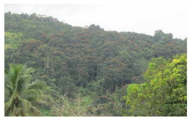
African tulip tree infestation in Fiji.