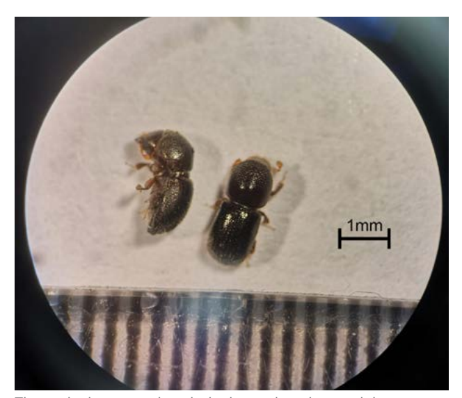
The polyphagous shot hole borer beetle – adults are on average 2.6mm in length.

species, mostly in urban areas. In indigenous forests, the spread of the beetle appears to be slow, with a few individual trees being attacked. The biggest threat it poses currently is to urban and ornamental trees such as English oaks ( Quercus robur ), box elders ( Acer negundo ), and London planes ( Plantus x acerfolia ). Monitoring efforts of the spread and impacts of the beetle are ongoing, with eight universities throughout South Africa, as well as overseas collaborators, forming a research network that is constantly sharing new information and ideas. This monitoring forms part of Garyn Townsend's MSc; he is registered at the University of Pretoria, with the Forestry and Agricultural Biotechnology Institute (FABI), but based at Rhodes University, and cosupervised by professors from both institutions.