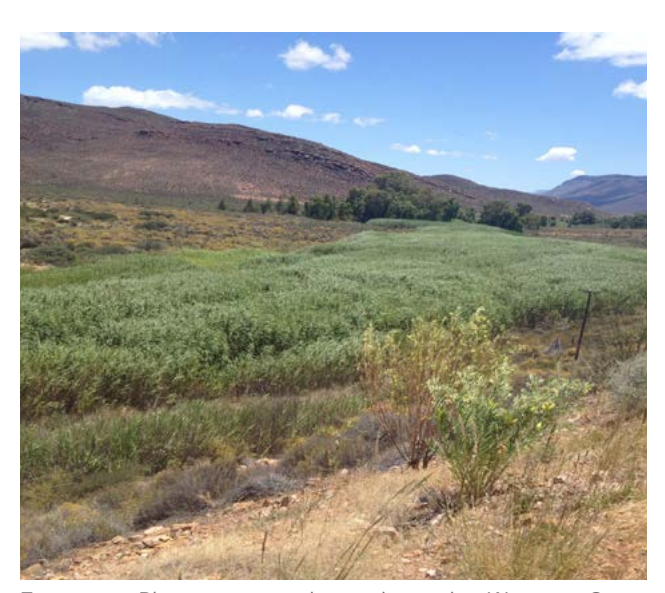
Expansive Phragmites reed stands in the Western Cape, South Africa.

The CBC undertook a genetic study to investigate whether or not this was occurring in South Africa. The study confirmed the native status of Phragmites australis and found no evidence of the introduction of nonnative lineages. This work has helped guide management strategies on expansive reed populations and determined that biological control cannot be considered as the reed is indigenous. Instead, other means of control, such as mechanical control, and the reduction of the number of impoundments on our river systems, need to be considered.