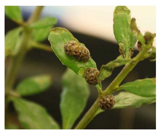
The ladybird beetle ( Cleta eckloni ) on African boxthorn.

research entities. Since the start of the programme, a researcher from CSIRO has travelled to South Africa to collect a rust fungus Puccinia rapipes from field sites, and PhD candidate, Evans Mauda, was able to transport the prioritised insect biological control agent, the ladybird beetle ( Cleta eckloni ) to Australia in February 2019.