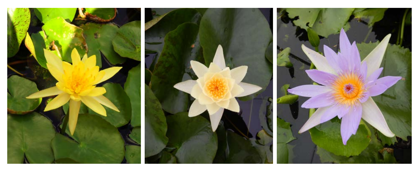
The invasive Mexican water lily (left) has bright yellow flowers with pointed petals. The leaves have smooth edges, are sometimes red on the underside, and may have purple or red blotches. Hybrids of the invasive Mexican water lily look similar (middle), but the flowers are often paler with more rounded petals. The flowers of the indigenous South African water lily (right), are normally blue, purple, or sometimes pink. The leaves have serrated edges and the leaves are smoother. Young leaves may have spots, but the larger more mature leaves are not spotted.

pilot studies and literature, Bagous americanus appears to have a narrow host range, restricted at least to the family Nymphaeaceae, and 120 individuals were imported into quarantine at Rhodes University at the end of October 2018. Attempts were made to start a culture of these insects, but while multiple generations successfully completed development, populations eventually died out in March 2019. In 2020, another culture of these weevils will be imported into quarantine, and hostspecificity testing will take place.