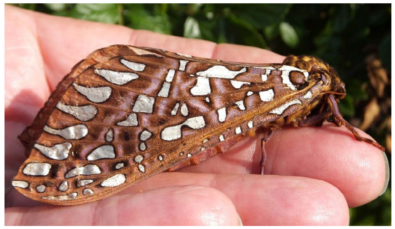
The adult Keurboom's moth is striking but seldom seen.