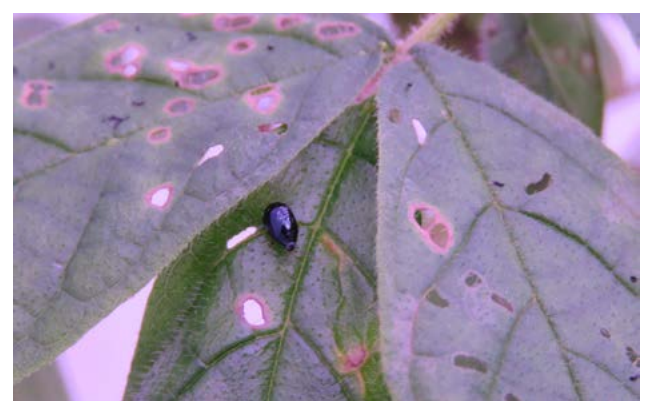
Damage by the flea beetle on the African tulip tree.

During 2019, host-specificity testing of an additional biological control agent, the flea beetle Paradibolia coerulea , was completed, and the Cook Islands authorities granted permission to release the agent in Rarotonga. The population of P. coerulea will be exported from the CBC quarantine to Rarotonga in early 2020. It is hoped that a combination of these two agents will reduce the density of African tulip trees on Rarotonga with benefits to indigenous biodiversity, including many rare endemic species found only on the island.