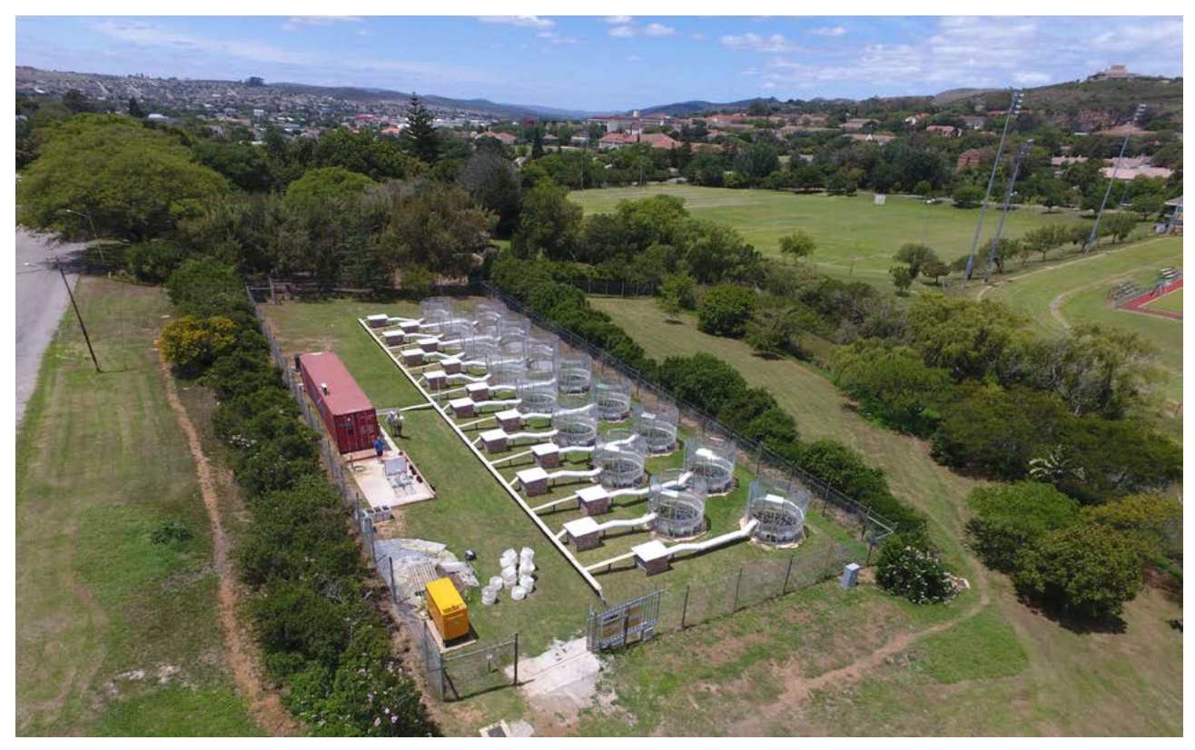
A bird's eye view of the open topped CO<sub>2</sub> chamber facility at Rhodes University.