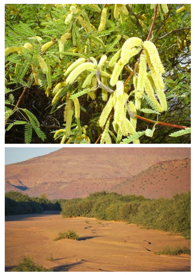
Prosopis trees produce prolific flowers (top) and seeds which are dispersed by browsers or washed away during flood events and deposited on floodplains to form dense impenetrable thickets (bottom).