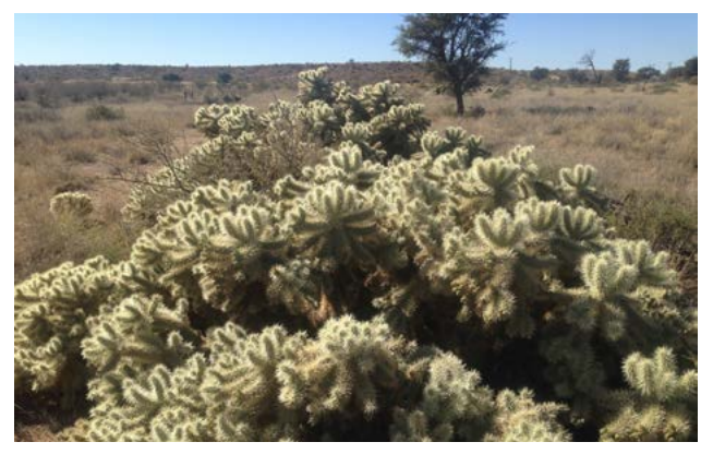
Thistle cactus is an extremely spiny plant that is harmful to wildlife and livestock.

COLLABORATORS Department of Primary Industries, Australia