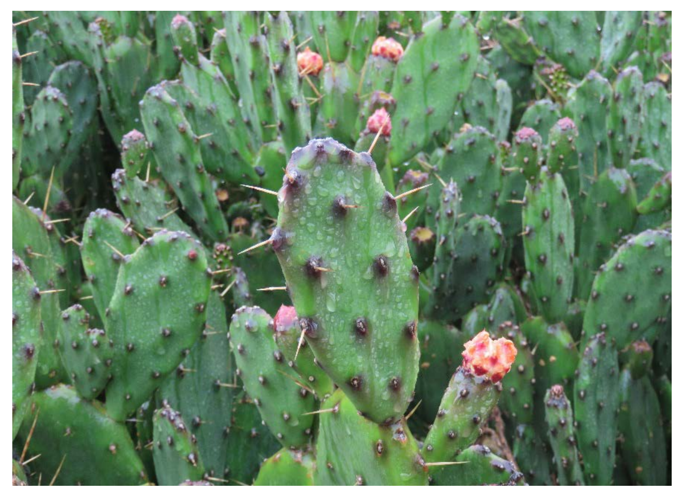
Opuntia elata, the orange-tuna cactus.

The CBC intends to import a variety of cochineal lineages for Opuntia elata in February 2020 and test which are the most effective at damaging South African Opuntia elata plants. The CBC will then conduct host-specificity tests and hybridisation trials using the most damaging lineage. A genetics project will also determine the origin of the South African Opuntia elata , which could be important in answering the question whether 'new' or 'old' associations are more effective biological control agents. This project is likely to result in an effective agent to combat a serious emerging invasive cactus.