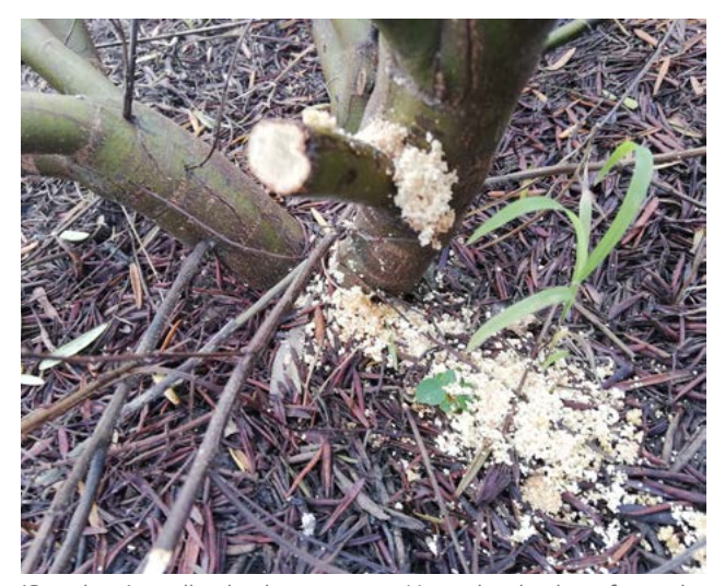
'Sawdust' - tell-tale damage in a Honeybush plant from the Keurboom's moth larvae.

The Keurboom moth is endemic in the Southern Cape region of South Africa, particularly where its natural hosts, the Keurboom tree ( Virgilia spp.), are apparent. Although often not seen, the adults are visibly striking on account of their size and patterning. Before the female dies, eggs are deposited around the base of host plants, where upon hatching, early instars exhibit a litter-phase prior to boring into the stems of host plants. Here they remain feeding on plant tissue as they develop through several more instars until pupation occurs, with adult emergence apparent in February to March. Larval tunnelling, as evident by 'sawdust' at the base of infested plants, has been shown to damage the structural integrity and vascular tissues of plants, resulting in stem dieback, which may lead