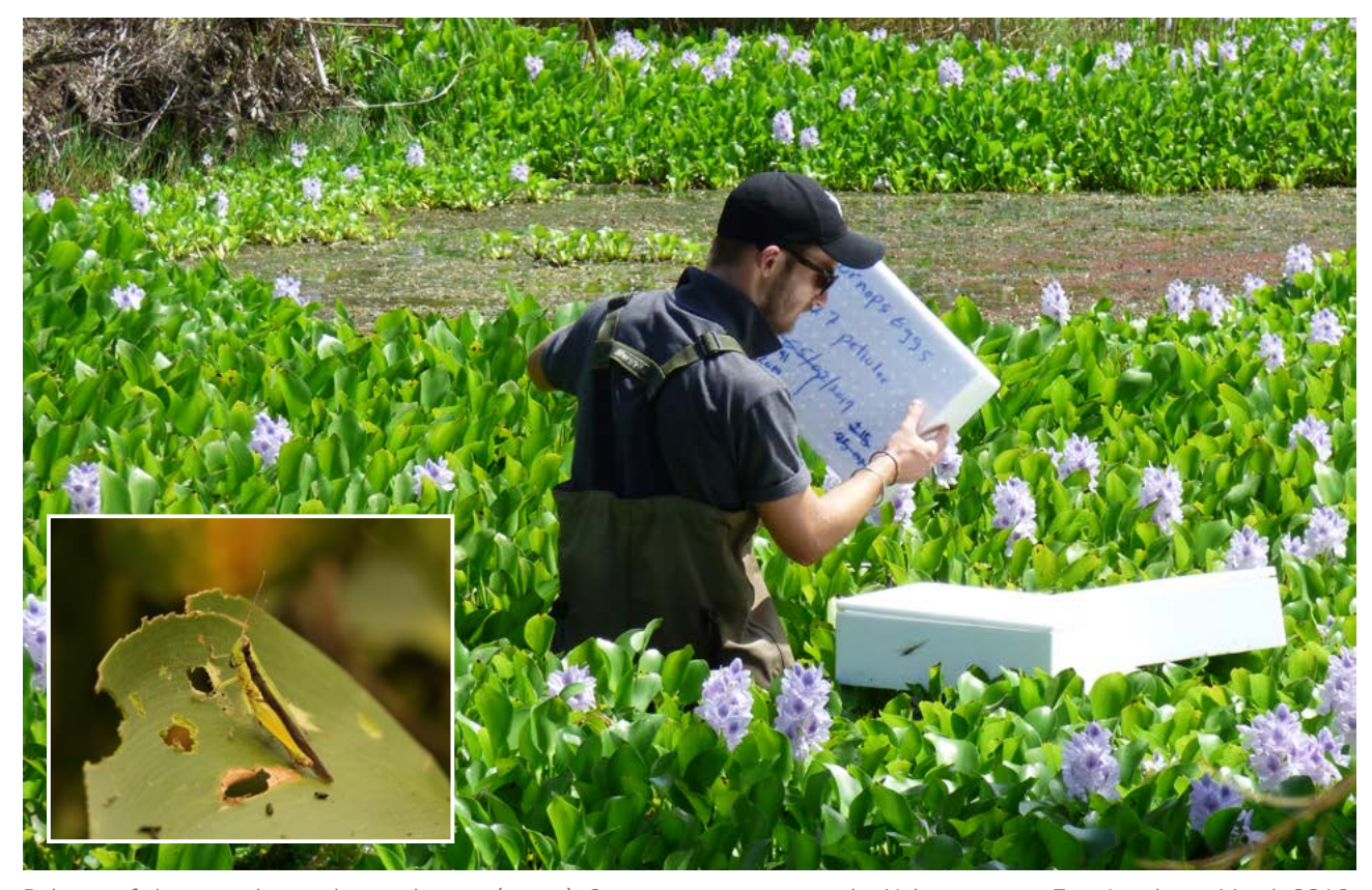
Release of the water hyacinth grasshopper (insert), Cornops aquaticum , on the Nahoon river in East London in March 2019.

requested that it be allowed to mass rear and release the insect intensively, to see if it could achieve establishment. Experiments are currently underway at the Nahoon River in East London to determine the best methods to gain establishment. The positive news is that the grasshopper overwintered in quarantine, and in the field. Efforts to increase the population in quarantine are underway so that more field releases may be made. A new culture of the insect was imported from Corrientes Province in Argentina into the CBC quarantine in December 2019. This new population will be kept separate and subjected to host-specificity testing before release.