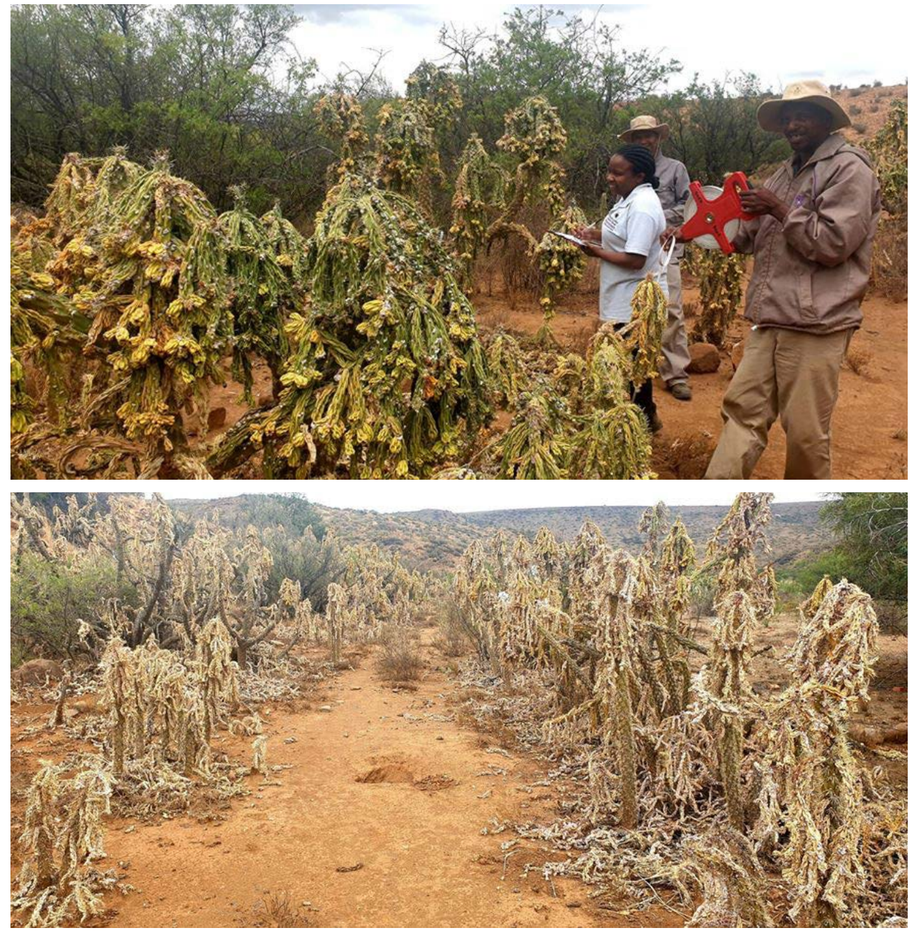
CBC Staff and students conducting long-term monitoring on the Devil's rope cactus (top) outside of Graaf-Reinet in the Eastern Cape, and the same site a few months later (bottom).

The Uitenhage research facility team with PhD candidate, Zezethu Mnqeta, joined the Mountain Zebra Camdeboo Protected Environment Ecologist at Camdeboo National Park to monitor released biological control agents in the buffer zone of the national park.