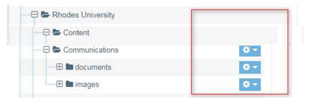
Figure 2: Media library, showing the folders you have access to