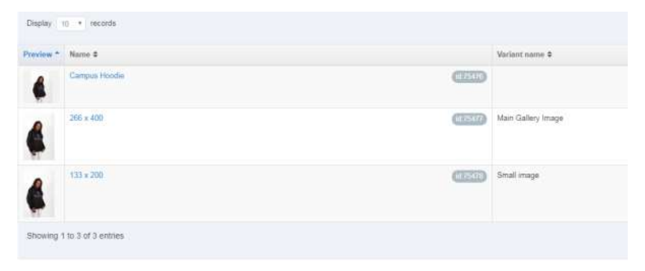
Figure 5: media variants with dimensions