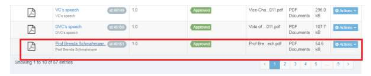
Figure 3: Selecting the highlighted document