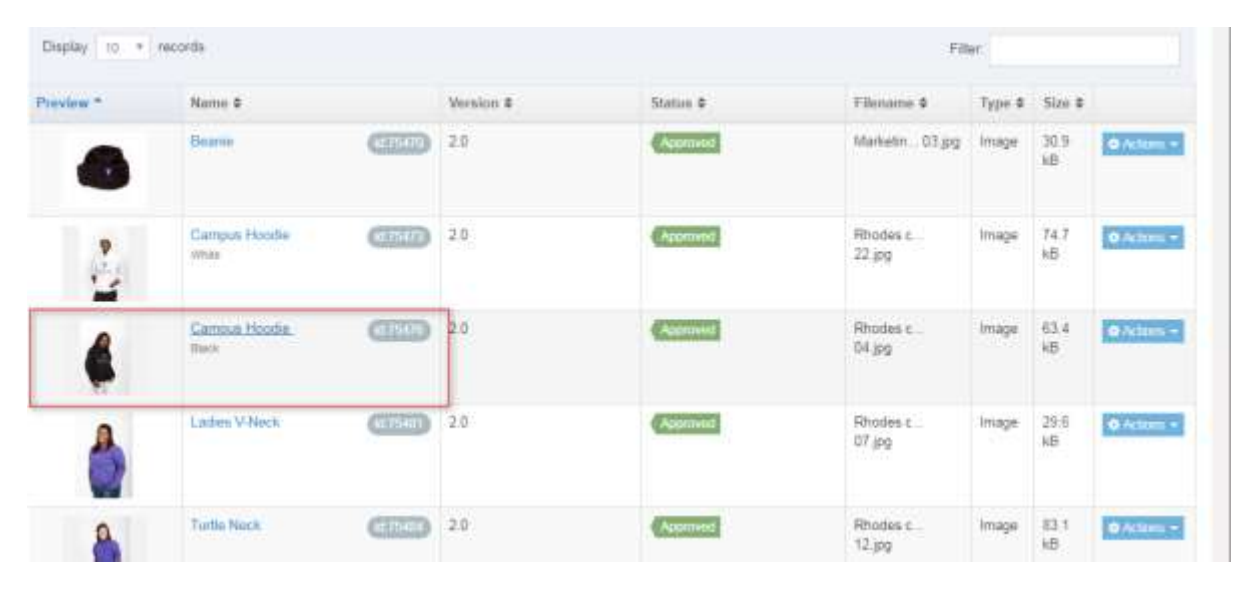
Figure 4: Selecting the Image