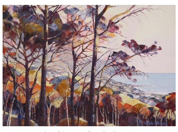
View of Camps Bay from The Glen, 1993