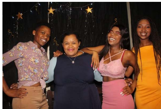
Phelps head student, warden and sub-wardens

Although a lot of good initiatives and events happened in the house this year, we also experienced a number of difficulties related to depression, anxiety and divide amongst a student and the house. During the year the house did experience seniors who felt that they were above the house rules. This created disparities amongst the seniors and the sub-wardens. We also had a few bullying incidents which the warden attended too and discussed with the concerned students. The support received from the hall warden also helped in dealing with these incidents, and that was something we did not have in the hall previously from permanent hall wardens.