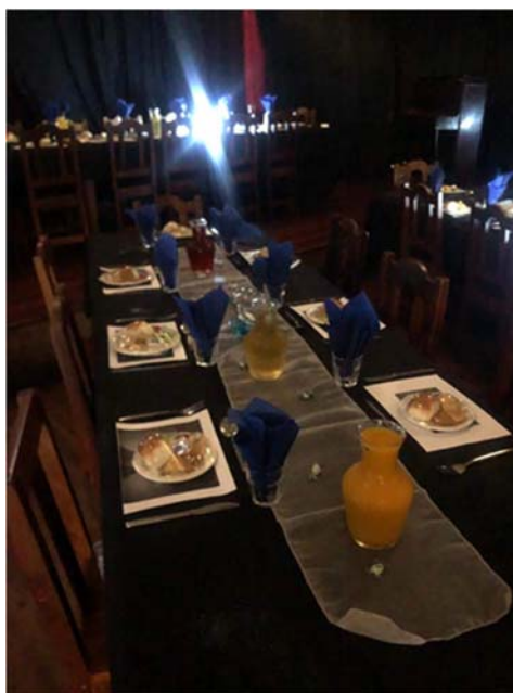
First years' at the brunch and Leaver's Dinner deco

This year in the hall we participated in the hall games which we won in partnership with Lilian Britten house. These games included playing different sports such as hockey and netball against other houses in the hall. A variety of students participated in the games ranging from first years to the seniors. As we realised that attending any events in the house was poor we decided to introduce an award called the 'Best House Spirit Award'. This proved as a great motivator for the students in the house as the numbers to attend the events increased.