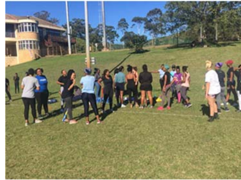
Hall Sport events

Although a lot of good initiatives and events happened in the house this year, we also experienced a number of difficulties related to depression, anxiety and divide amongst a student and the house. During the year the house did experience seniors who felt that they were above the house rules. This created disparities amongst the seniors and the sub-wardens. We also had a few bullying incidents which the warden attended too and discussed with the concerned students. The support received from the hall warden also helped in dealing with these incidents, and that was something we did not have in the hall previously from permanent hall wardens.