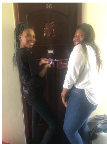
Sub-warden Welcoming First Year