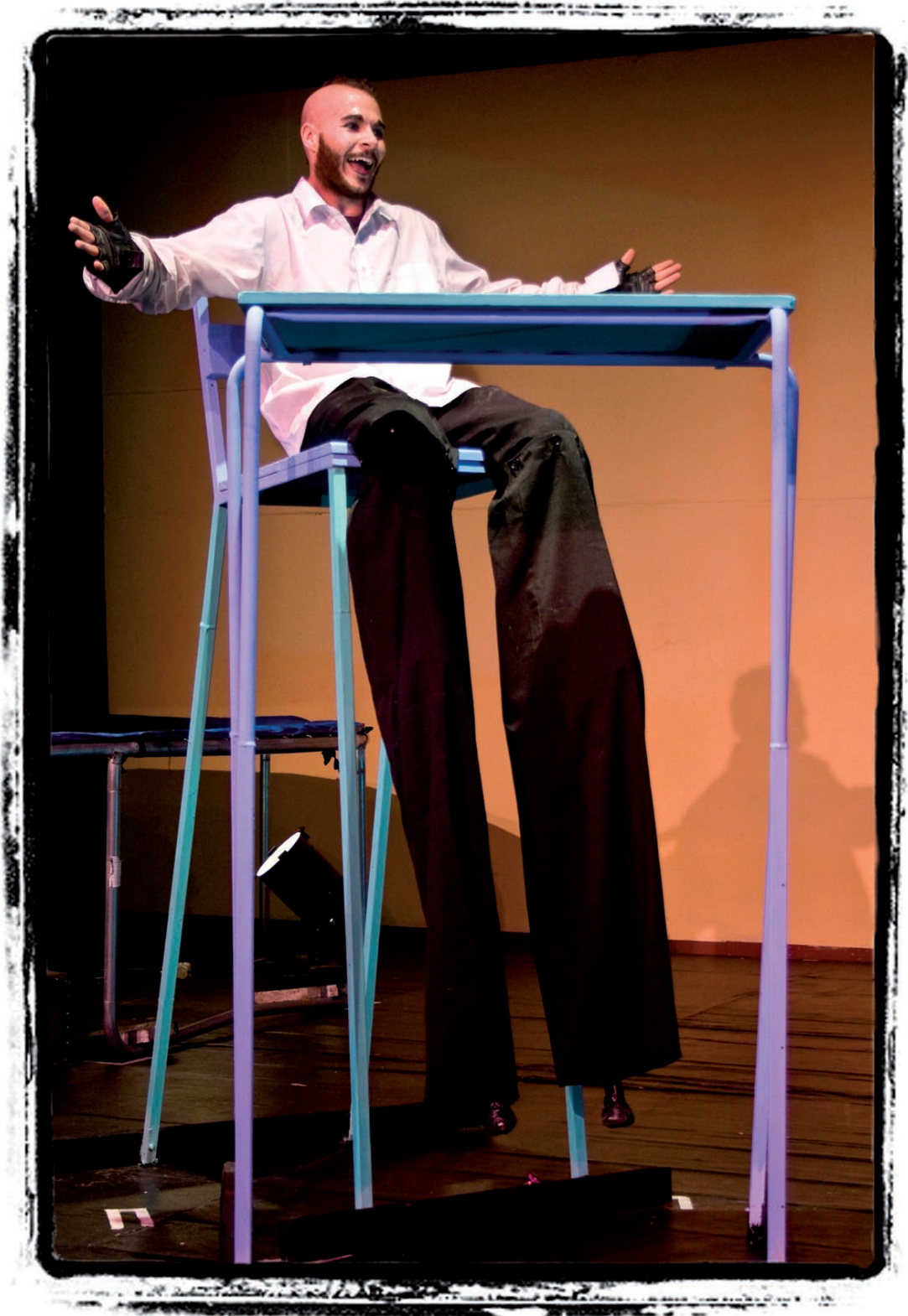
Rhodes Drama Review 2008