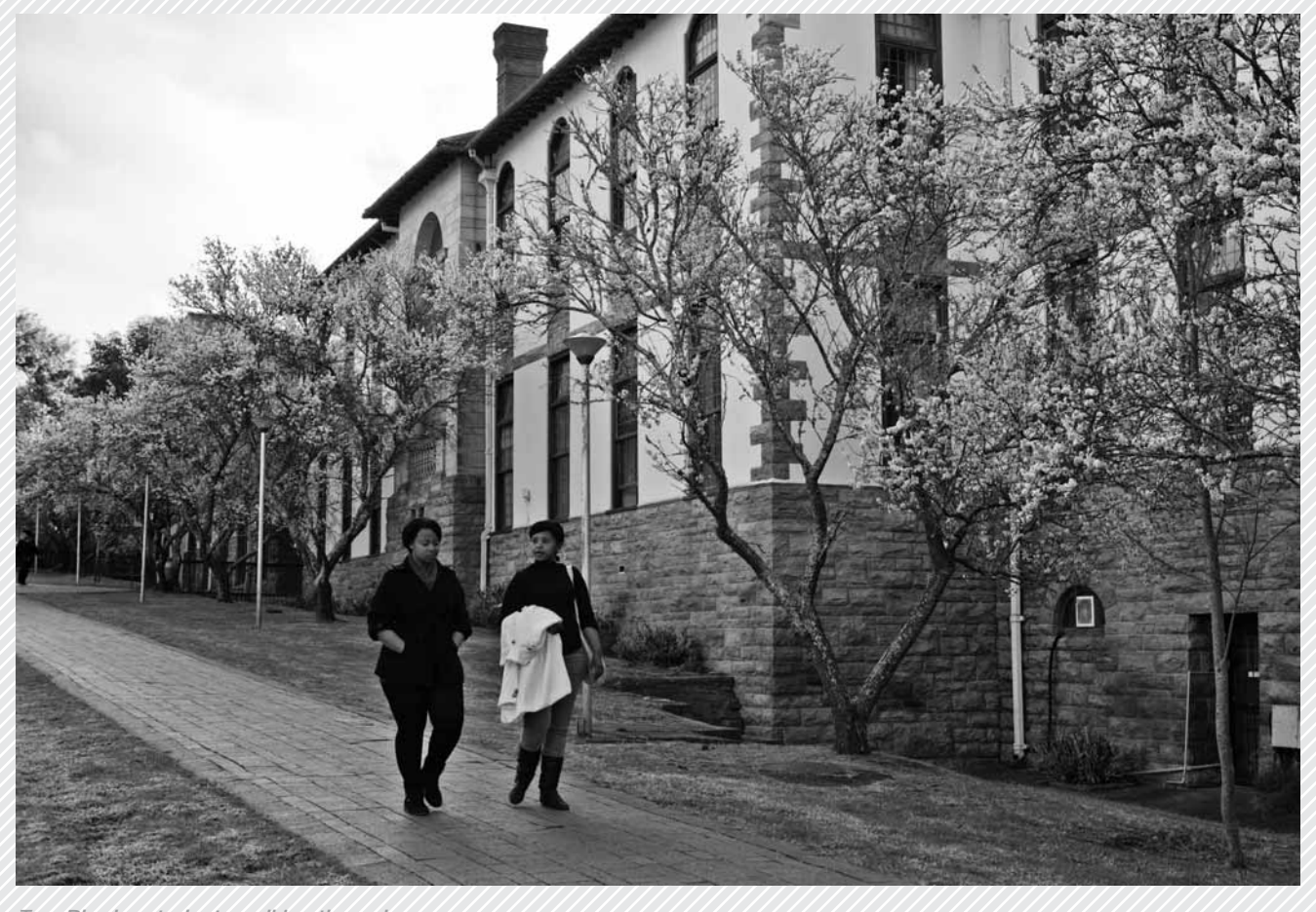
Two Rhodes students walking through campus