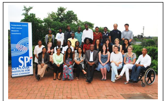
PDMM Class of 2010 with SPI staff

I'd say they must give it their all because it gets really hectic yet so bearable. They will not regret doing the PDMM because, at the end of it all, they will be fully equipped to enter the working world.