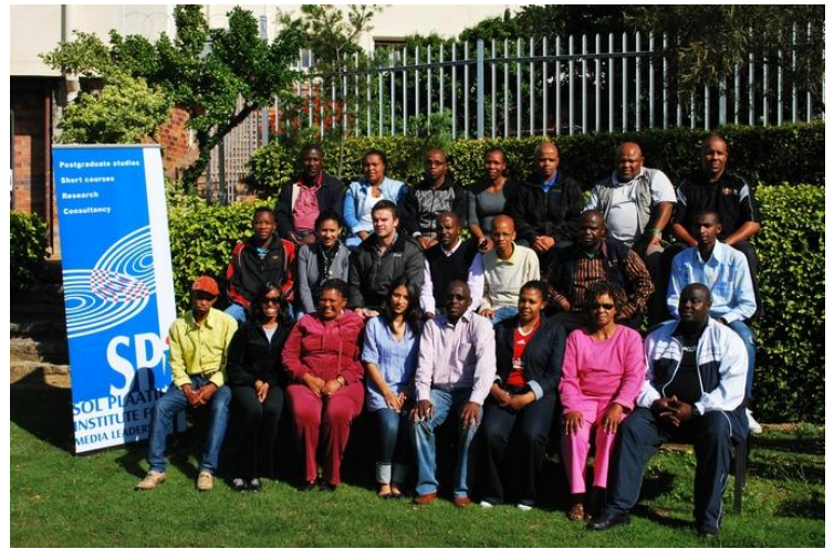
Above: Communications Officers who attended the “Government Media: Essential Tools for Editors and Journalists” course at the SPI from 27 Sept-1 Oct 2010

TS: The course was designed and developed by the SPI. Among the modules taught is how to become an effective and credible communicator; how to design and develop a government communications strategy and campaign; the role of the media in society, and leadership and management of a government communications agency. Some of the modules are taught by your Rhodes people while I focus on government communications-specific modules. I make them (the course participants) understand the environment in which they operate in by bringing relevant newspaper clippings for them to engage with and analyse. This allows the government communicators to appreciate the important role being played by the media in general, and allows them to understand how to use the media to their own advantage in getting their message across, rather than seeing their counterpart as the enemy.