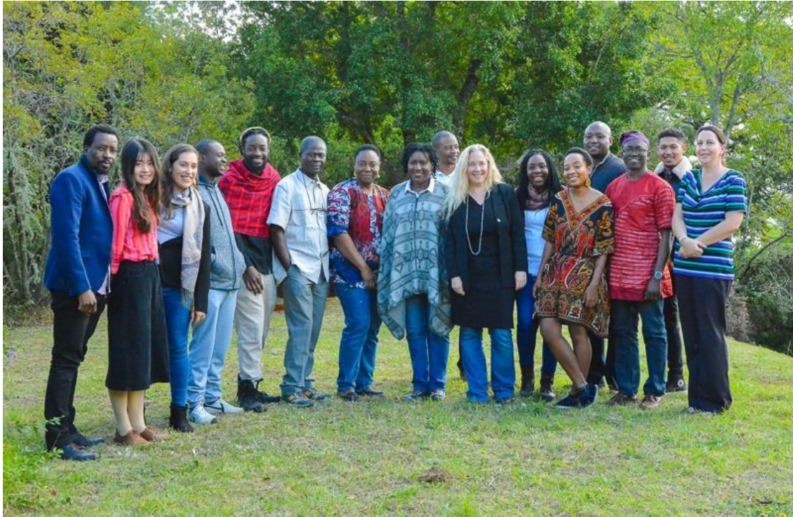
Arts of Africa and Global Souths research team (2018)