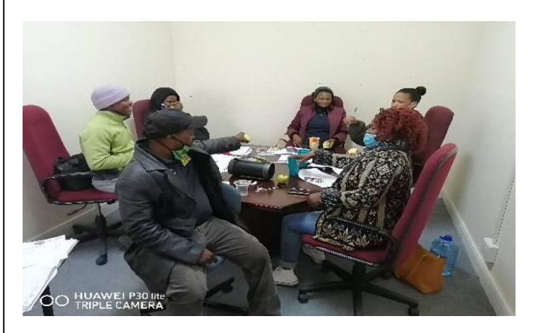
Picture 1: CLOs during and citizen monitor during the meeting at Maclear office

The <u>Pilot survey</u> covered a wide range of socioeconomic, livelihoods questions, and also featured some questions that speak to Climate Change Adaptation. The survey aims to come up with Social indicators to help the Tsitsa Project, Tsitsa River catchment residents and a team of researchers to track social impacts coming from a range of activities that seek to give effect on land restoration, sustainable land management and improved livelihoods. Thirty-three people participated in the Pilot survey which was conducted by Community Liaison Officers (CLOs). After the Pilot survey was completed, the CLOs, Tsitsa Project team and LIMA held a feedback meeting to discuss how the survey can be improved so that it can be rolled out in future. The meeting was conducted via Zoom and CLOs met at the LIMA offices in Maclear and used one Zoom profile to engage.