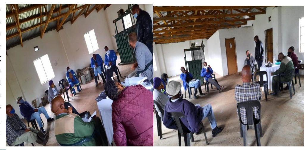
Picture 1: Famers from Lower Tsitsana and LIMA during the meeting about grazing association agreement

Farmers in Lower Tsitsana showed a keen interest in forming a grazing association (Shed Association of Farmer), and met with LIMA to get information on what the processes are to form a grazing association, and what the benefits of an association, in terms of accessing wool markets and auctions, are. LIMA shared a detailed presentation of the requirements of forming a grazing association and discussed the benefits with the group. (Picture 1)