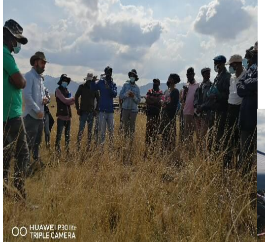
Picture 2: Briefing from CSA and Meat Natural officials to farmers from Tsitsa Project and Bulwer during livestock auction at Maluti.

Livestock farmers from Sinxaku and Tsitsana attended a livestock auction held in Matatiele to get exposure and experience on how the auction is conducted and the benefits of having grazing association in place (Pictures 2 and 3).